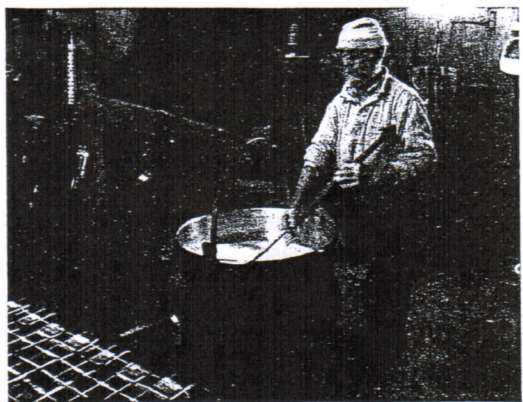
LEFT: Traditional cheesemaking in a copper kettle.