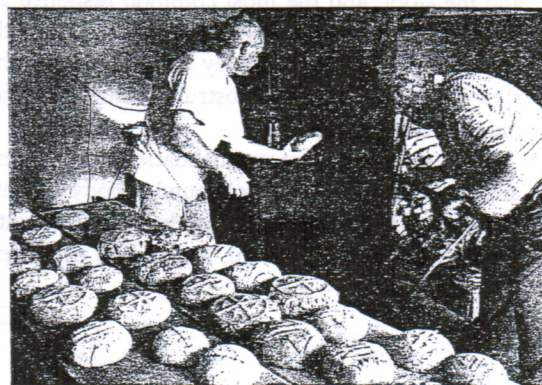
RIGHT: Traditional sourdough breadmaking.